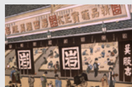
A drawing of Iwataya when it was a kimono shop