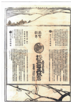
A national newspaper advertisement announcing the Department Store Declaration