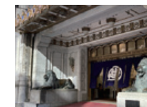
Lion statues at the main entrance of Mitsukoshi Nihombashi Main Store