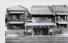
Iseya Tanji Kimono Fabric Shop

Founder Tanji Kosuge opened a kimono fabric store. The store focused on obi and patterns, providing unique products such as kimono with the Goshuden pattern, and gained popularity.